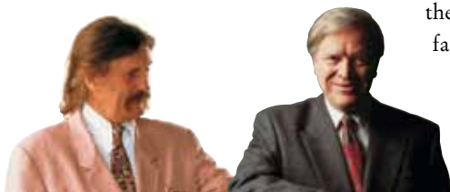
Prof. Luigi Colani

A dream can become something beautiful, because it can develop into an idea, and the idea into reality. In this case, a grand piano that seems to hover in midair, in a vibrant elegance unmatched anywhere in the world, symbolized by a golden Pegasus figurine mounted on its top, representing the winged stallion of classical Greek